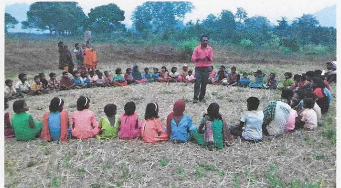
Training for village children