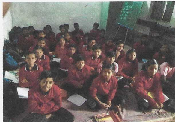
Children in the Education Activity Centres

The desire of HCDI is to increase the number of projects to cover a higher number of children in India, and hence a couple of more donor organizations in Europe are being approached. Since the year (1995) this organization has been formed; by the grace of GOD, it has been possible to touch the lives of so many children. HCDI's commitment to maintaining a high quality of the programs of the existing projects and our accountability to donors remains steadfast.